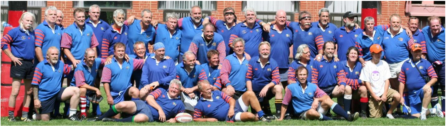
2007 Florida Old Boys in Aspen