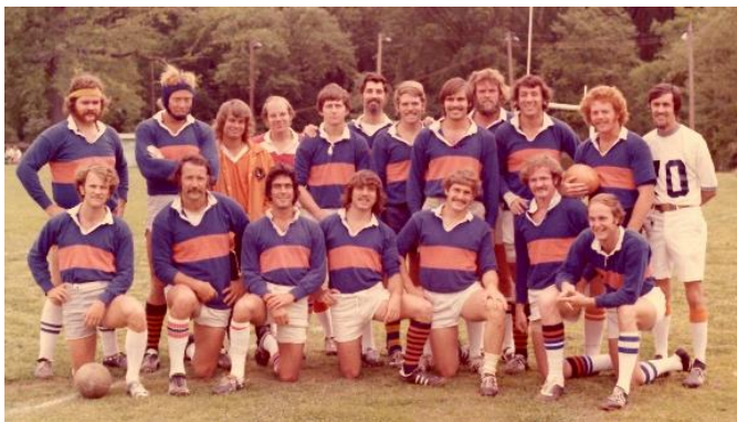
1973 Florida Old Boys at Cotton Carnival