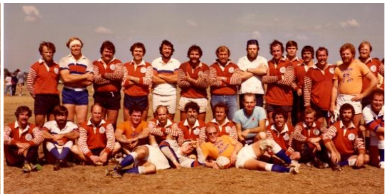
1979 FOB Gator Invitational