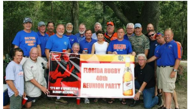
40th UFRFC Anniversary, 2009